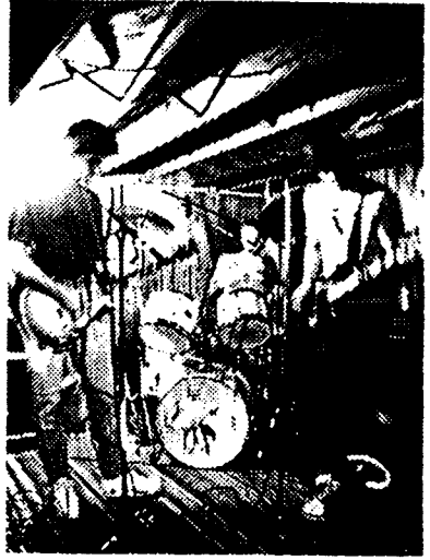
Carp 18 getting ready to practice their showstopping backflips

2nd place was taken by Klang who scored 343 points with their tight, hard-hitting performance. They won $312 in gift certificates to use at the Gultar Center in Roseville. Just to put that in perspective, that would be good for about 1 decent power amp, or 4 1/2 Sure SM57 microphones, or 7 effect boxes, or 20 guitar stands, or 78 sets of strings, or 1,560 guitar picks.