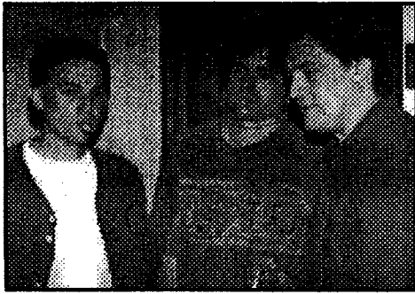
Dear Mr. Editor Sir- The photos of Carp 18 performing at Stand-up Frank's should be back from Proex shortly before we go to press. For position we're using this shot from their high school yearbook "Voted Most Likely to Become Stand-up Frank's Regulars." --- Production Artist #393

Perhaps some fantasies seem trivial to others, like an acquaintance of mine who talks about Uma Thurman with great excitement...oh never mind. Anyway after a few months of trying to make the complicated arrangements the band performed two sets starting at 10:00 AM this past Wednesday.